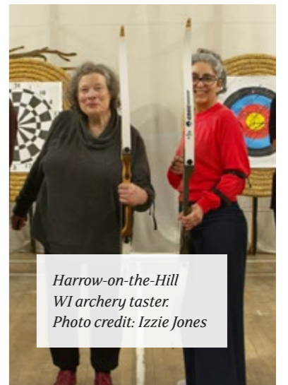
Harrow-on-the-Hill WI archery taster.

Last year, three teams were merged into one centralised Education Team for NFWI and Denman Trust, and the new Education Team's work has focused on, identifying the benefits of building essential skills; understanding how to engage adults in learning and exploring the most effective ways of delivering essential skills; and creating pioneering service experiences for both charities.