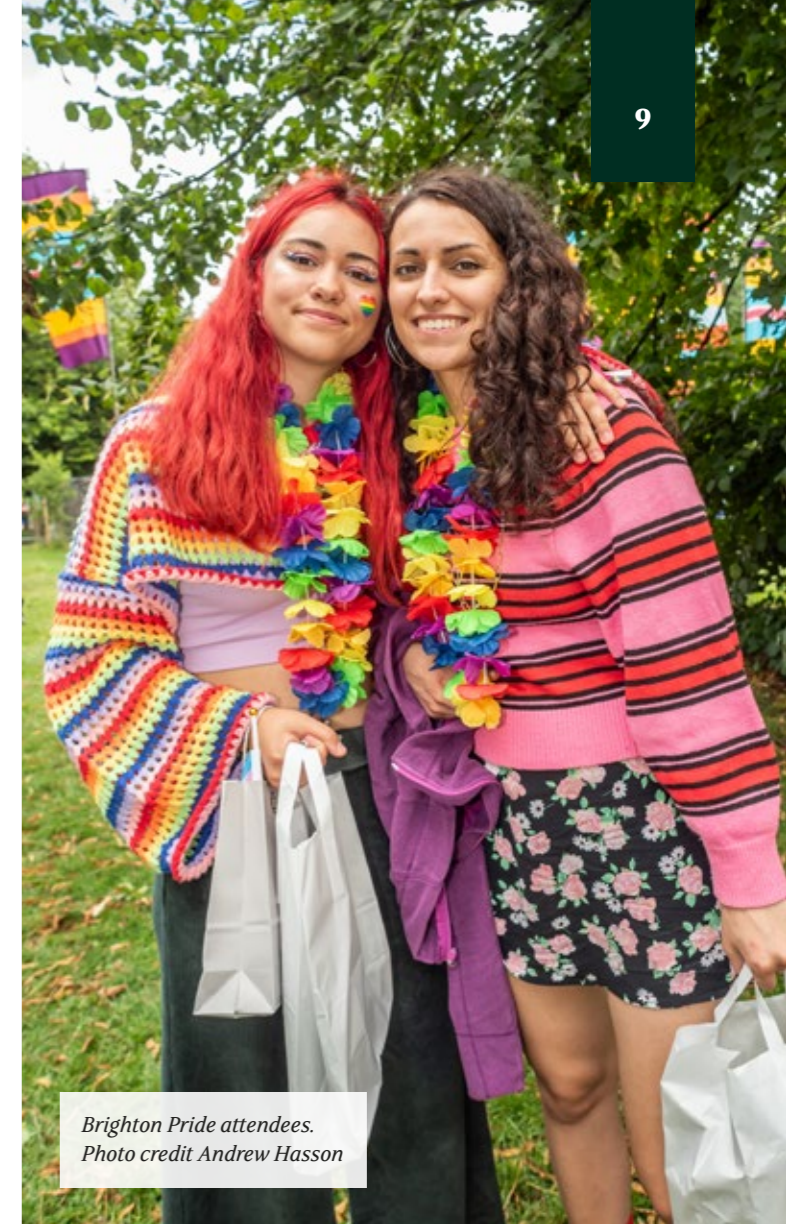
Brighton Pride attendees.

In our commitment to inclusion and showing solidarity to all women, NFWI attended Brighton Pride. We had a brilliant day raising awareness of the WI with our stand which featured photos of our wonderful members, lots of promo material and WI-branded giveaways. NFWI Trustees and staff volunteered to hold the stall and we had local WI members stopping to say hello as well as speaking to many interested women on the day, giving us the opportunity to promote local and virtual WIs as well as our new WI Supporter options.