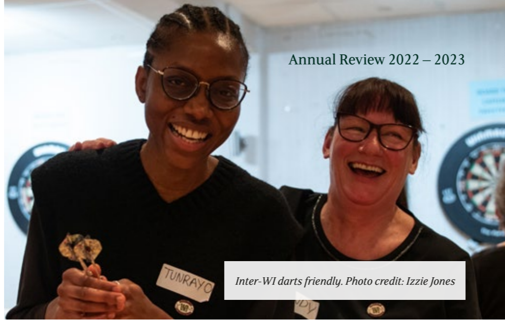
Inter-WI darts friendly.