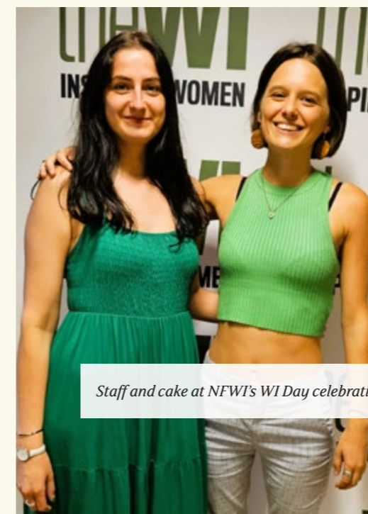
Staff and cake at NFWI's WI Day celebration at 104