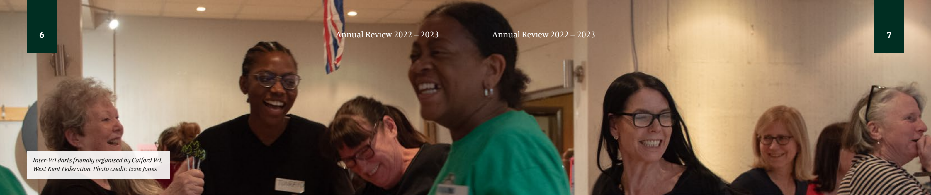
Inter-WI darts friendly organised by Catford WI, West Kent Federation.