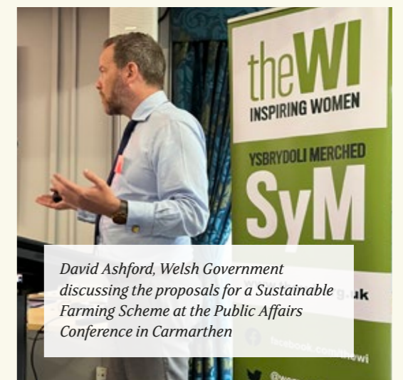
David Ashford, Welsh Government discussing the proposals for a Sustainable Farming Scheme at the Public Affairs Conference in Carmarthen