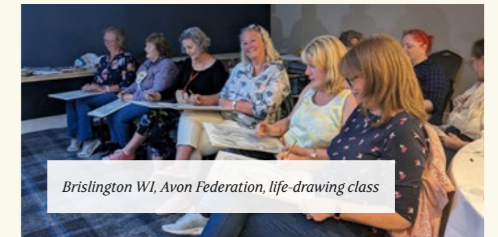
Brislington WI, Avon Federation, life-drawing class

Our WI promo video was also created and launched for WI Day 2023. This is a short video on our website and on social media which features our wonderful members – the heart of the WI. It showcases the friendship and community our members have found, the exciting and rewarding activities they enjoy and highlights that we are a campaigning organisation. Please go to the website and share the video on your own social media.