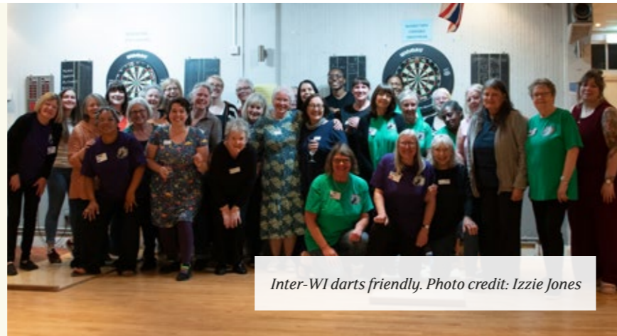
Inter-WI darts friendly.