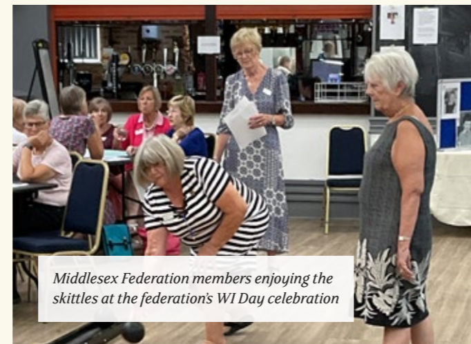
Middlesex Federation members enjoying the skittles at the federation's WI Day celebration