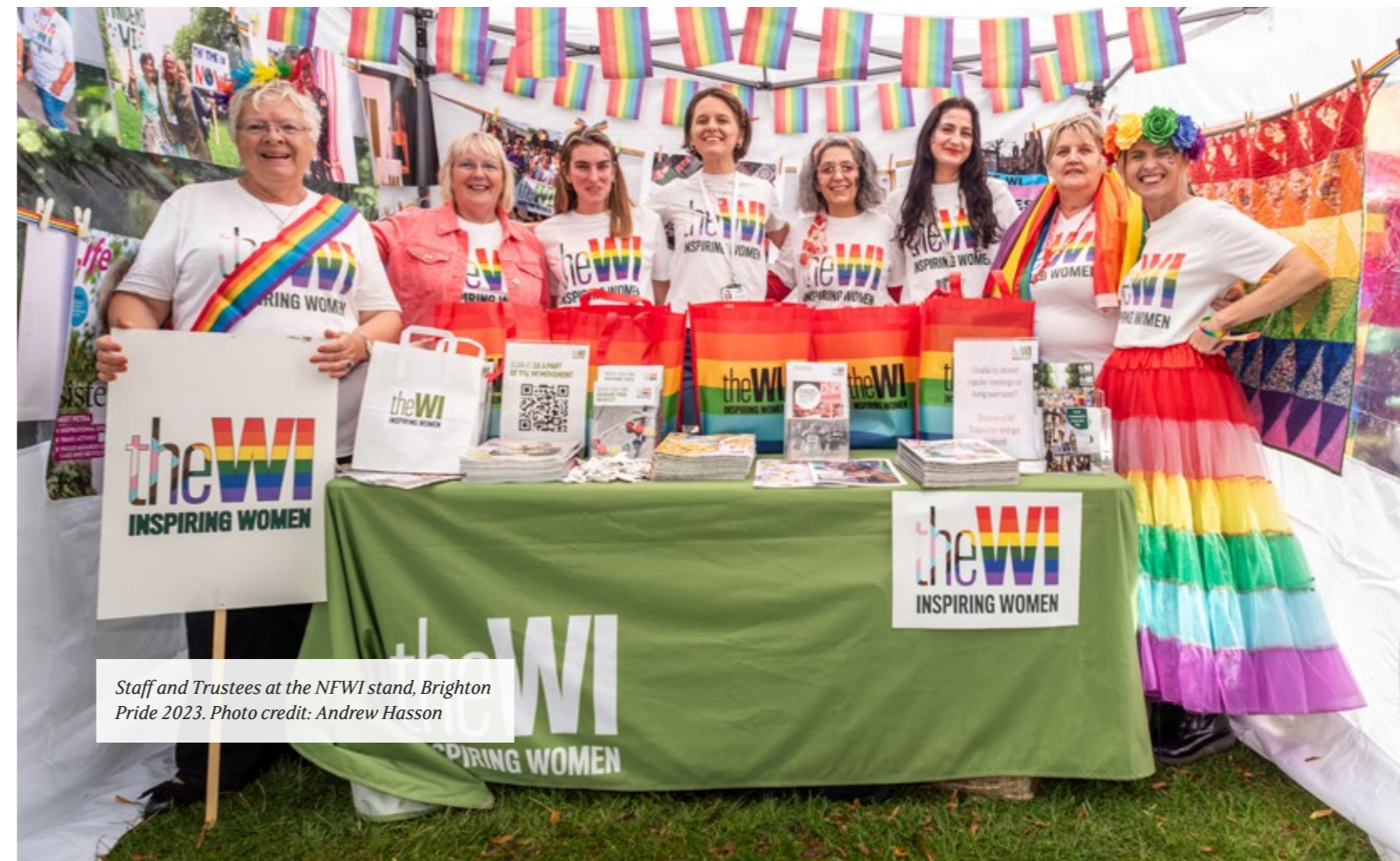
Staff and Trustees at the NFWI stand, Brighton Pride 2023.

Commercial partnership, WI Life and branded WI items.