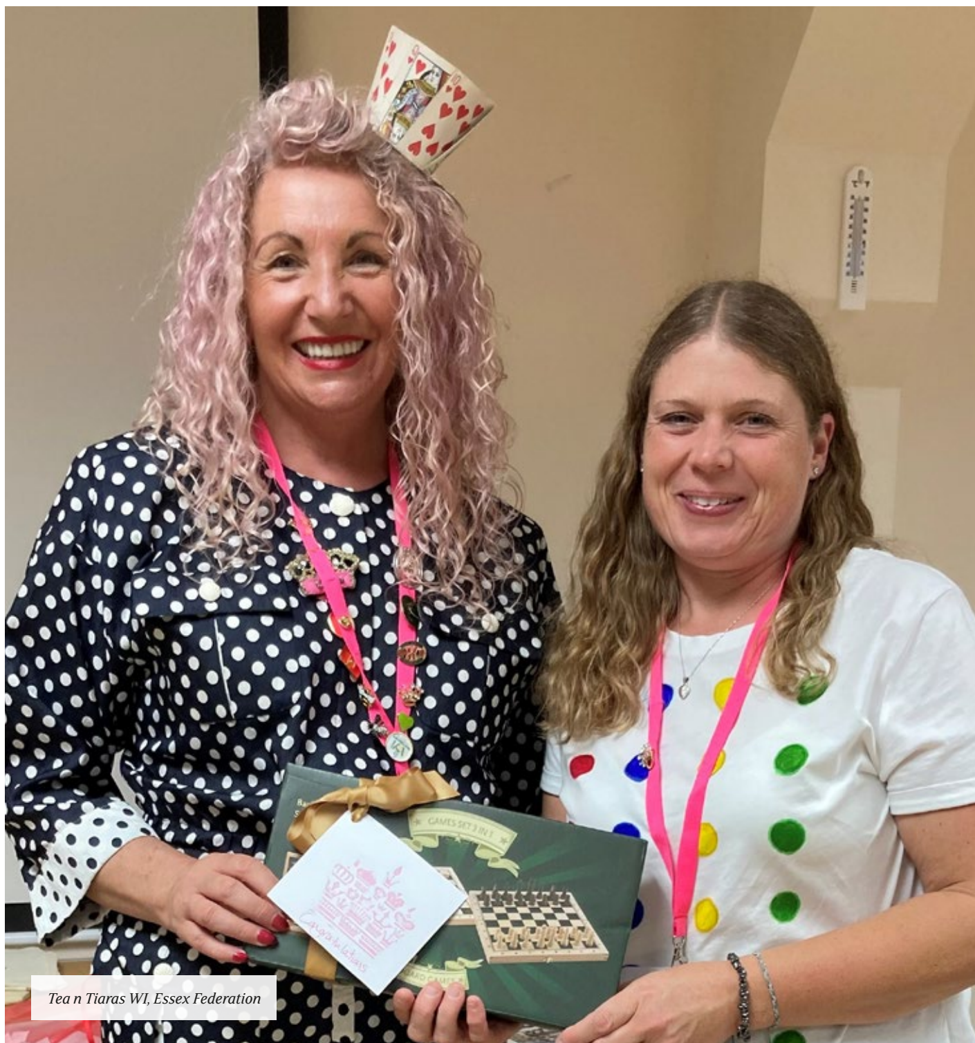
Tea n Tiaras WI, Essex Federation