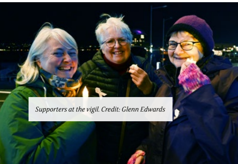
Supporters at the vigil.