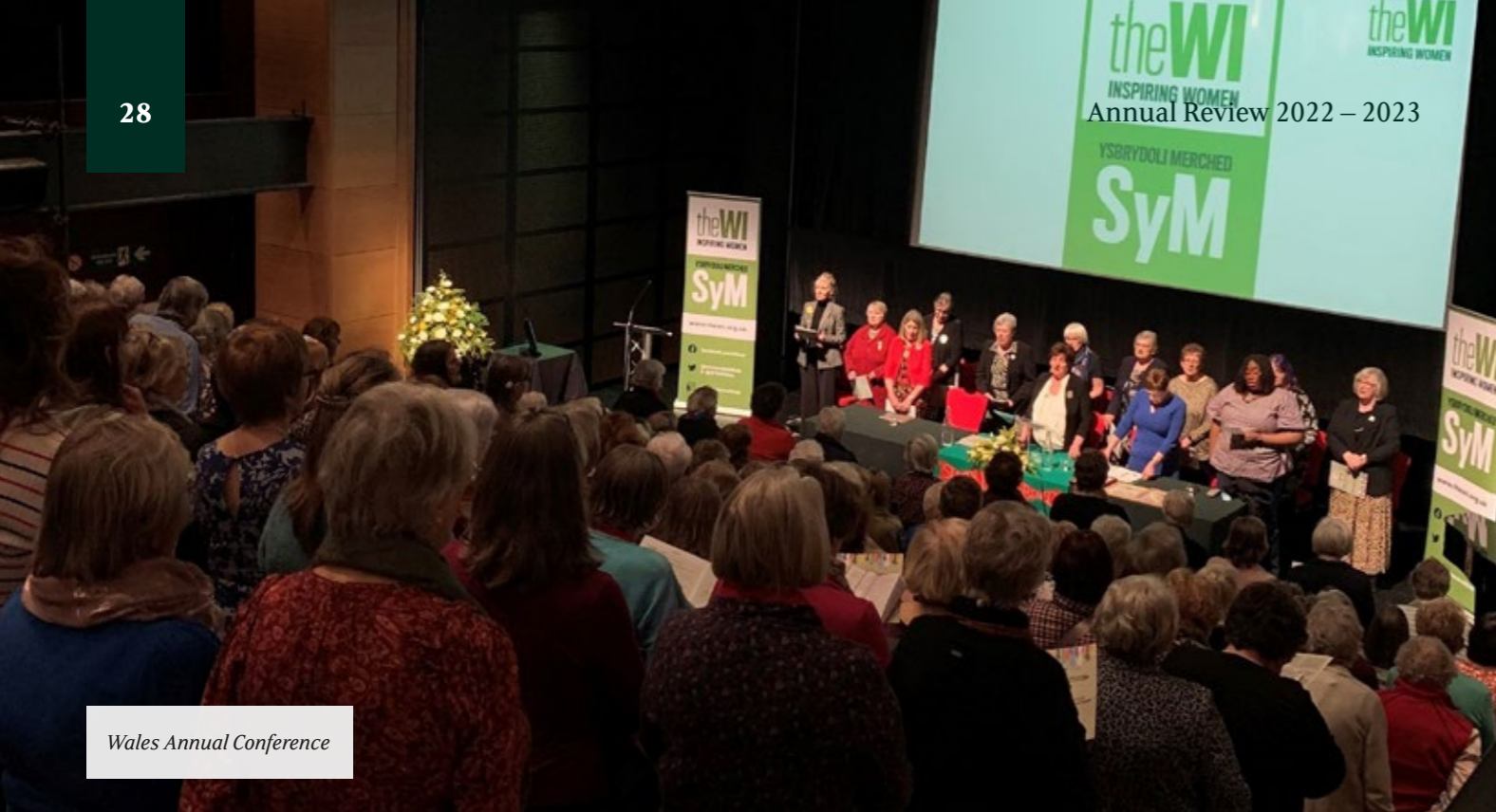
Wales Annual Conference