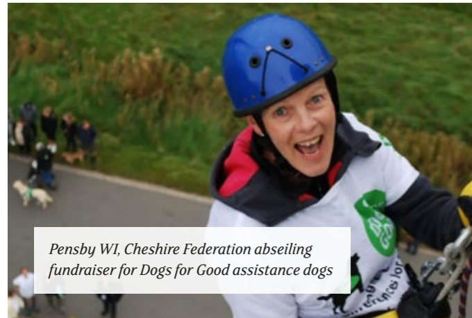
Pensby WI, Cheshire Federation abseiling fundraiser for Dogs for Good assistance dogs

As a growing and inclusive organisation, we know it is important to offer our members the support and framework they need for the successful running of WIs. This includes all the work we do to ensure our policies are up to date and fit for purpose. The NFWI Safeguarding Policy was released in January 2023, and training has been rolled out to the Federation Safeguarding Officers (FSOs). Feedback has been positive, including FSOs feeding back how they will pass on updates to their WIs, such as putting information into the federation newsletters.