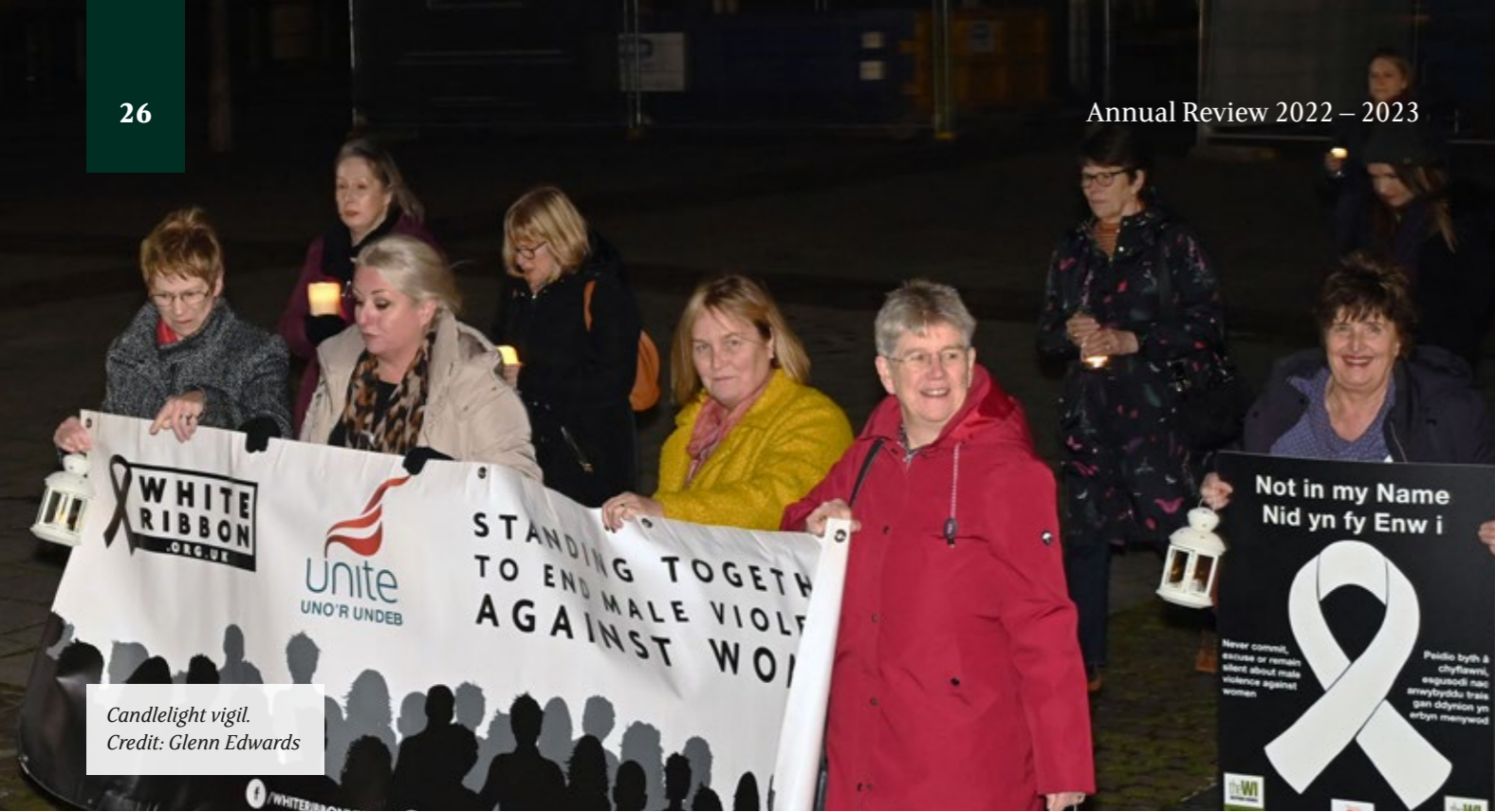
Candlelight vigil.