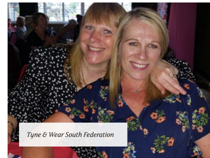
Tyne & Wear South Federation

WIs with 51 members or more Hawley WI, Berkshire Federation