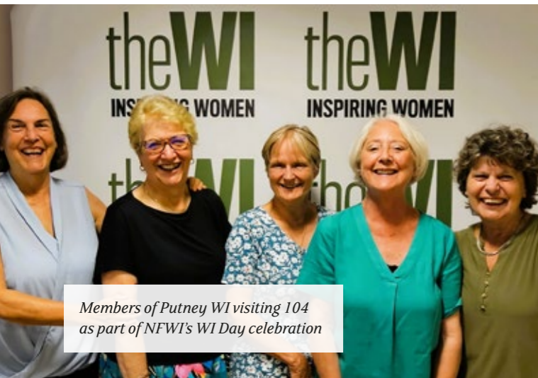
Members of Putney WI visiting 104 as part of NFWI's WI Day celebration

As a growing and inclusive organisation, we know it is important to offer our members the support and framework they need for the successful running of WIs. This includes all the work we do to ensure our policies are up to date and fit for purpose. The NFWI Safeguarding Policy was released in January 2023, and training has been rolled out to the Federation Safeguarding Officers (FSOs). Feedback has been positive, including FSOs feeding back how they will pass on updates to their WIs, such as putting information into the federation newsletters.