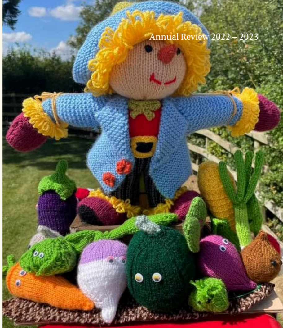
Annual Review 2022 – 2023

The initiative aims to support people to make small changes, wherever practical and possible, to grow food in a way that can benefit nature.