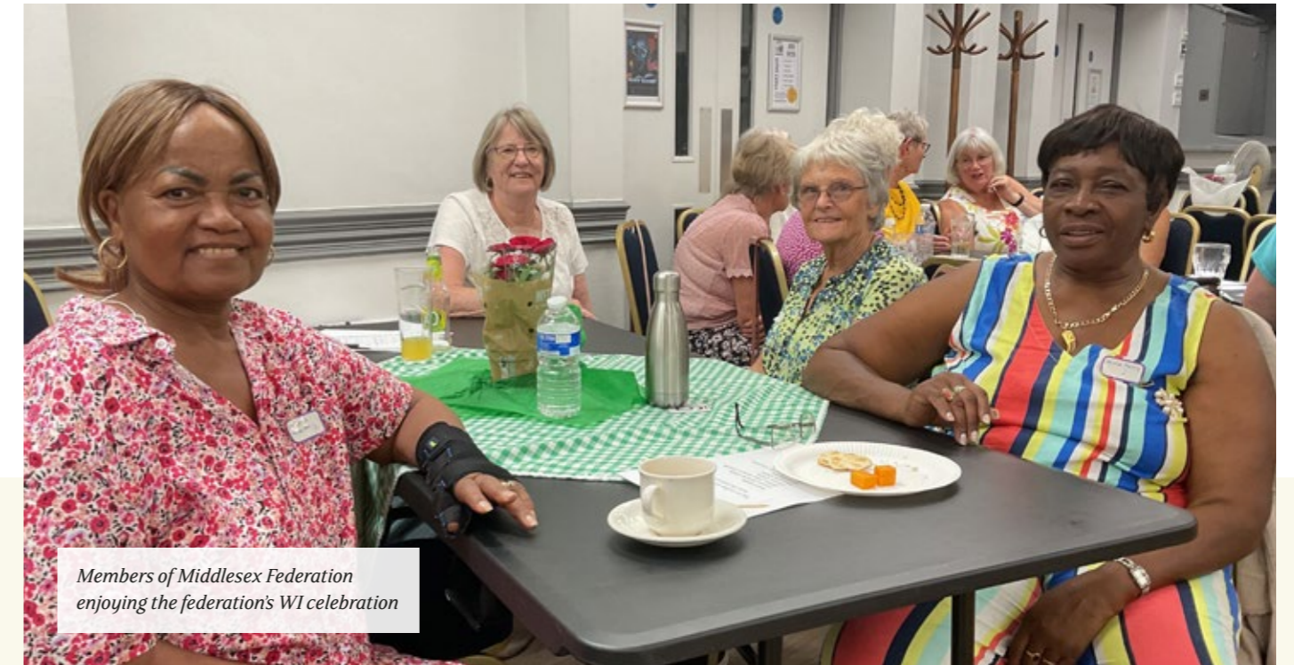
Members of Middlesex Federation enjoying the federation's WI celebration

Our WI promo video was also created and launched for WI Day 2023. This is a short video on our website and on social media which features our wonderful members – the heart of the WI. It showcases the friendship and community our members have found, the exciting and rewarding activities they enjoy and highlights that we are a campaigning organisation. Please go to the website and share the video on your own social media.