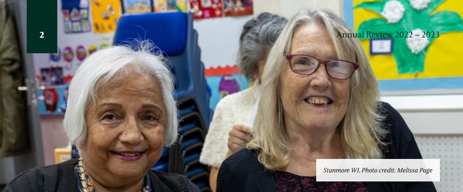
Stanmore WI.