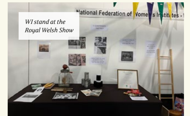
WI stand at the Royal Welsh Show

The theme of the 2023 Rose Bowl (produce and handicraft) and Brecon Cup (floral art) competitions was 'All Things Bright and Beautiful', and congratulations go to the winners Powys – Brecknock Federation who won the Rose Bowl and Ceredigion Federation who took the Brecon Cup.